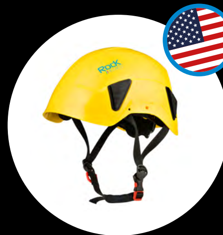
Dynamo Ansi Work at height, industrial, rescue.