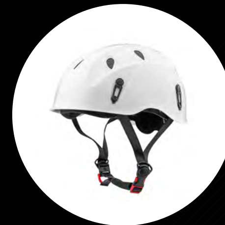
Master 397 Work at height, industrial, rescue.