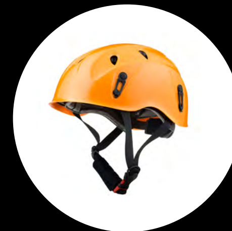
Master Junior Pro

Mountaineering, caving, canyoning, adventure parks, rope courses, rescue.