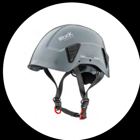
Dynamo 397 Industrial, rescue, forestry.