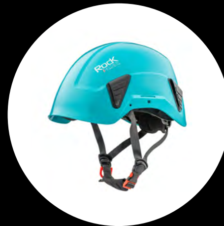
Dynamo Hybrid Work at height, industrial, rescue, forestry.