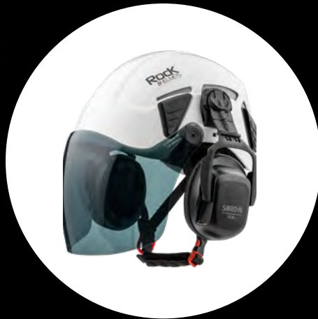
Long visor - toned grey + Ear protectors