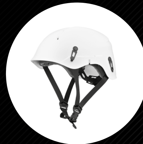
Vertik Industrial, rescue.