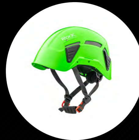
Dynamo Plus Mountaineering, rock climbing, rescue, work at height, forestry.