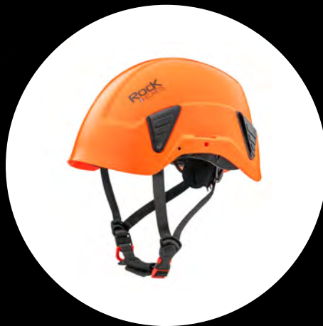
Dynamo Volt Work at height, industrial, rescue.