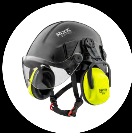
Short visor - clear + Ear protectors

For more details on the products, visit www.rockhelmets.com and request the 2023/2024 workbook