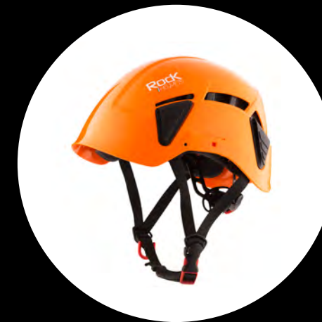
Dynamo Mountaineering, rock climbing, rescue, work at height, forestry.