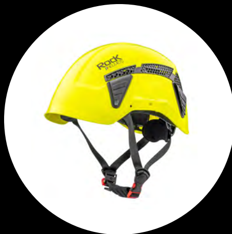
Dynamo 397 Plus Industrial, rescue.