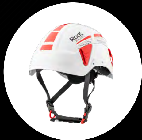
Red reflective stickers