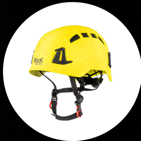
Uniko Construction, work at height, rescue and much more

For more details on the products, visit www.rockhelmets.com and request the 2023/2024 workbook