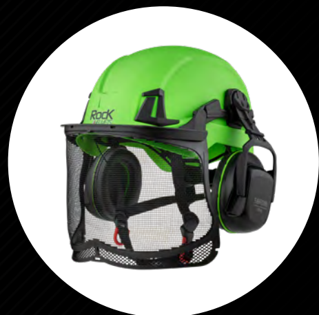
Metal mesh Visor + Ear protectors

Examples of the combination helmet/accessories